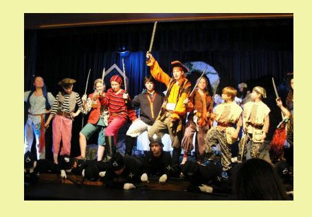
Morningside Theatre Company Presents!

Edina Morningside Church offers 3 summer camps for children of all ages. Show announcements and registration forms and will be available on January 18th. Join in the fun!