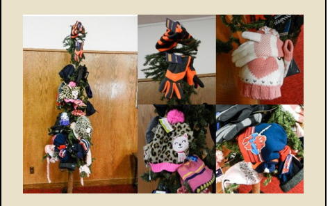
The Mitten Tree is Loaded!

all the merrier. Blessings from Women's Fellowship.