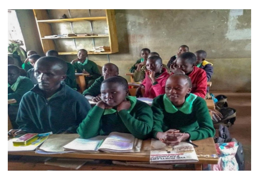
support Daylight in your prayers.